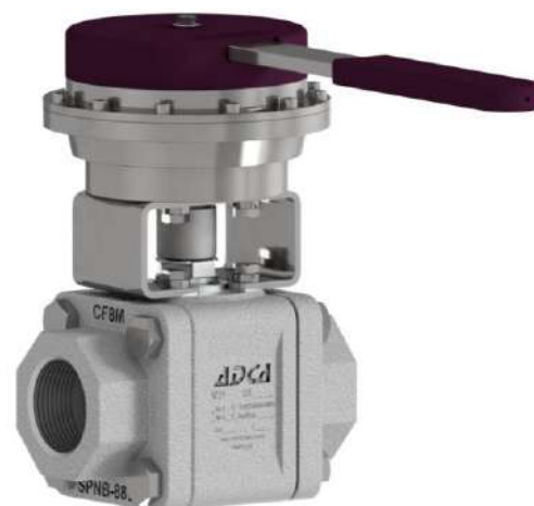
"Dead-man" lever ball valve.